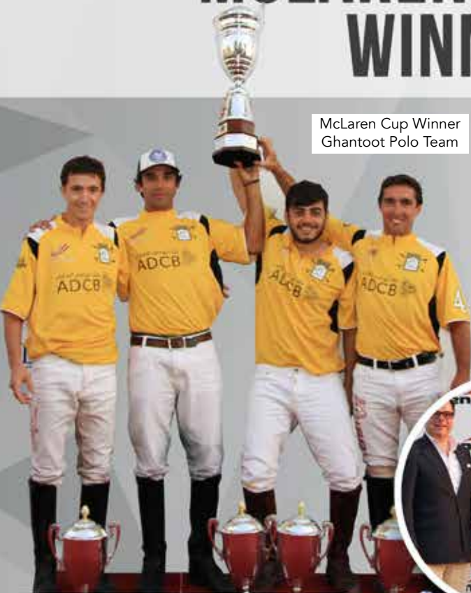
McLaren Cup Winner Ghantoot Polo Team