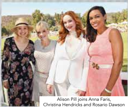
Alison Pill joins Anna Faris, Christina Hendricks and Rosario Dawson