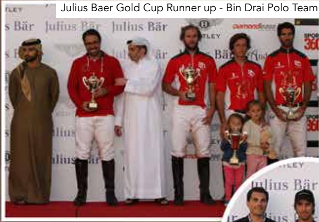
Julius Baer Gold Cup Runner up - Bin Draï Polo Team