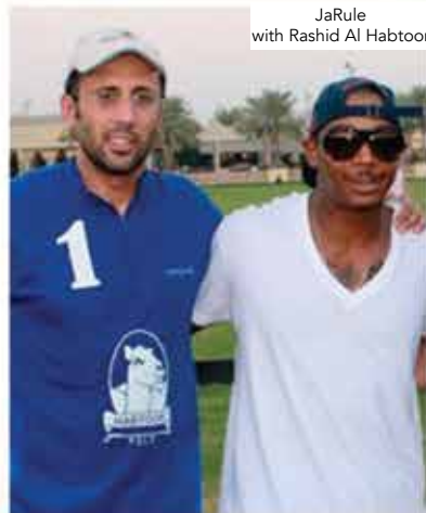
JaRule with Rashid Al Habtoor