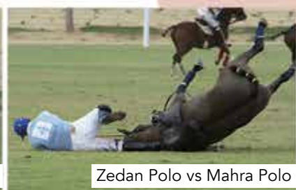
Zedan Polo vs Mahra Polo