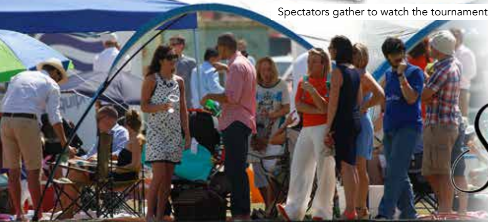
Spectators gather to watch the tournament