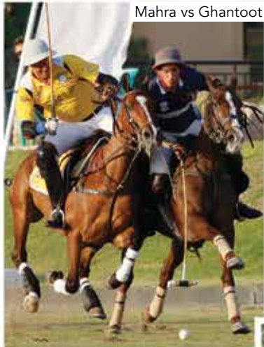
Mahra vs Ghantoot