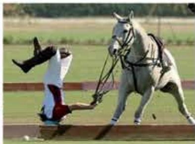
The importance of wearing a helmet