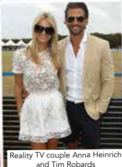
Reality TV couple Anna Heinrich and Tim Robards