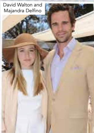
David Walton and Majandra Delfino