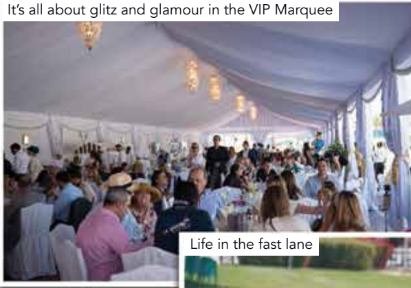
It's all about glitz and glamour in the VIP Marquee