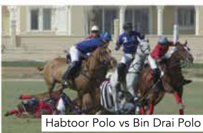
Habtoor Polo vs Bin Draï Polo