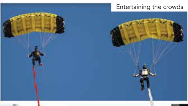
Entertaining the crowds