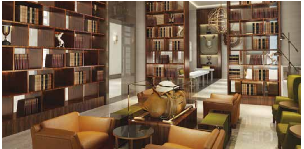
Fit for a King: Upmarket living for residents of the equestrian haven.

136 Key St. Regis Dubai Al Habtoor Polo Resort & Club 500 Luxury villas including 24 St. Regis branded villas 156 Stables 4 Polo fields