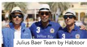
Julius Baer Team by Habtoor