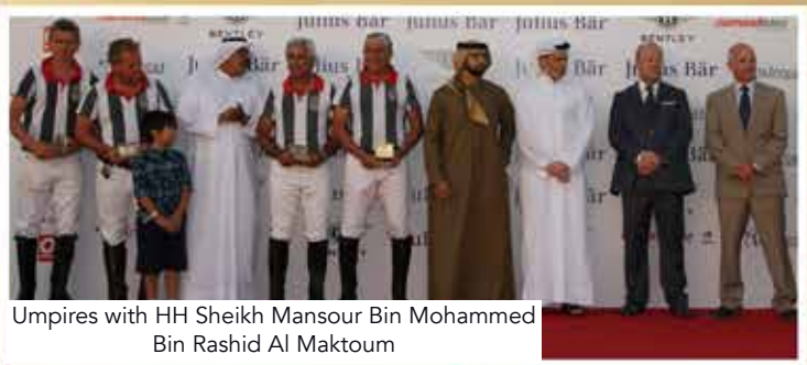
Umpires with HH Sheikh Mansour Bin Mohammed Bin Rashid Al Maktoum