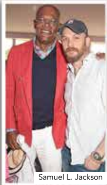
Samuel L. Jackson