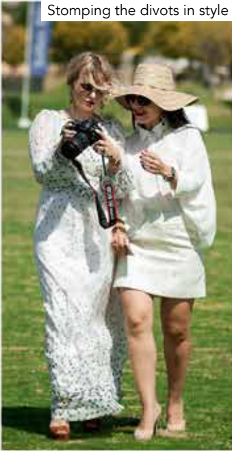
Stomping the divots in style