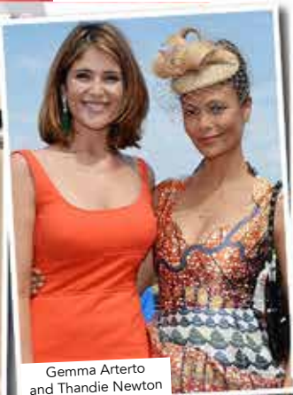
Gemma Arterto and Thandie Newton