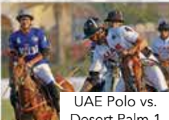
UAE Polo vs. Desert Palm 1