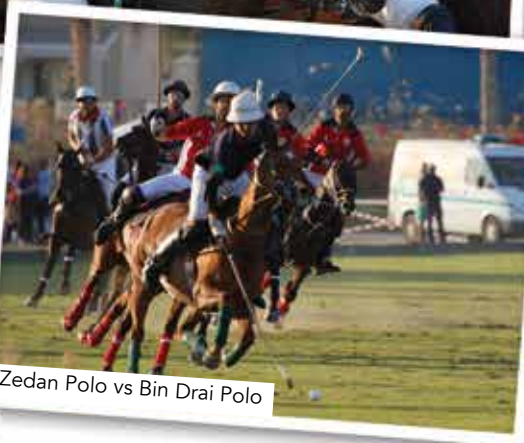
Zedan Polo vs Bin Draï Polo