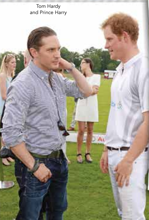
Tom Hardy and Prince Harry