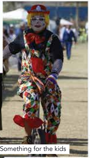
Something for the kids