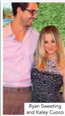
Ryan Sweeting and Kaley Cuoco