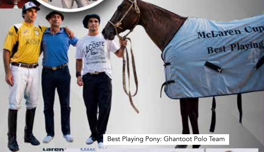
Best Playing Pony: Ghantoot Polo Team