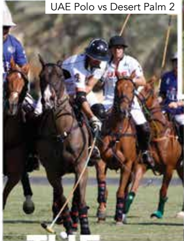
UAE Polo vs Desert Palm 2