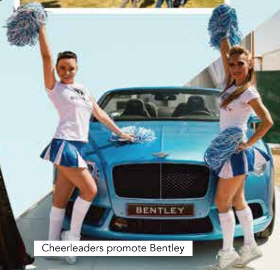
Cheerleaders promote Bentley