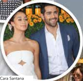
Cara Santana and Jesse Metcalfe