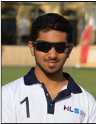
Khalaf R. Al Habtoor