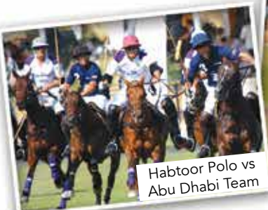
Habtoor Polo vs Abu Dhabi Team