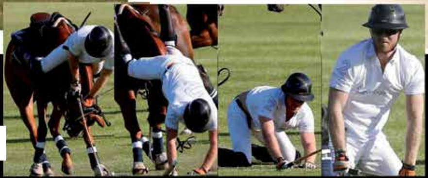
Prince Harry falls off during a fundraising polo match.