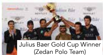
Julius Baer Gold Cup Winner (Zedan Polo Team)