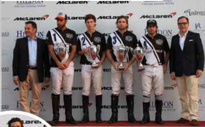
McLaren Cup Runner up - Desert Palm 2 Polo Team