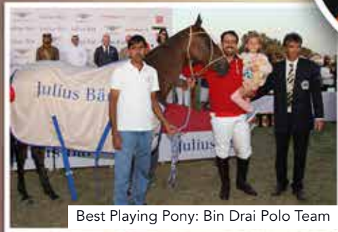
Best Playing Pony: Bin Draï Polo Team