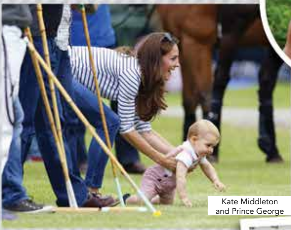
Kate Middleton and Prince George