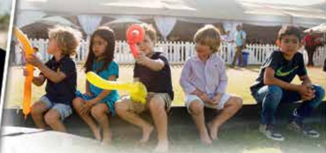
Polo is for all ages