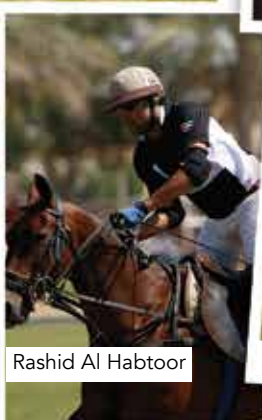
Rashid Al Habtoor