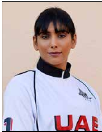
Her Highness Sheikha Maitha bint Mohammed bin Rashid Al Maktoum