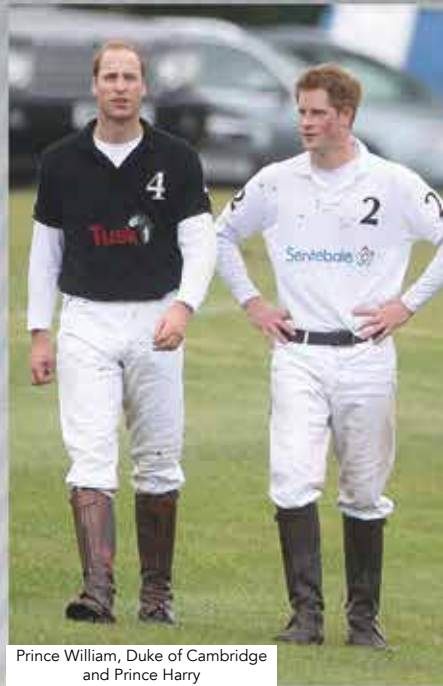
Prince William, Duke of Cambridge and Prince Harry