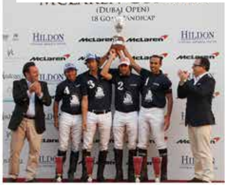
Hildon Cup Winners - Habtoor Polo Team