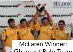
McLaren Winner: Ghantoot Polo Team