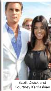
Scott Disick and Kourtney Kardashian