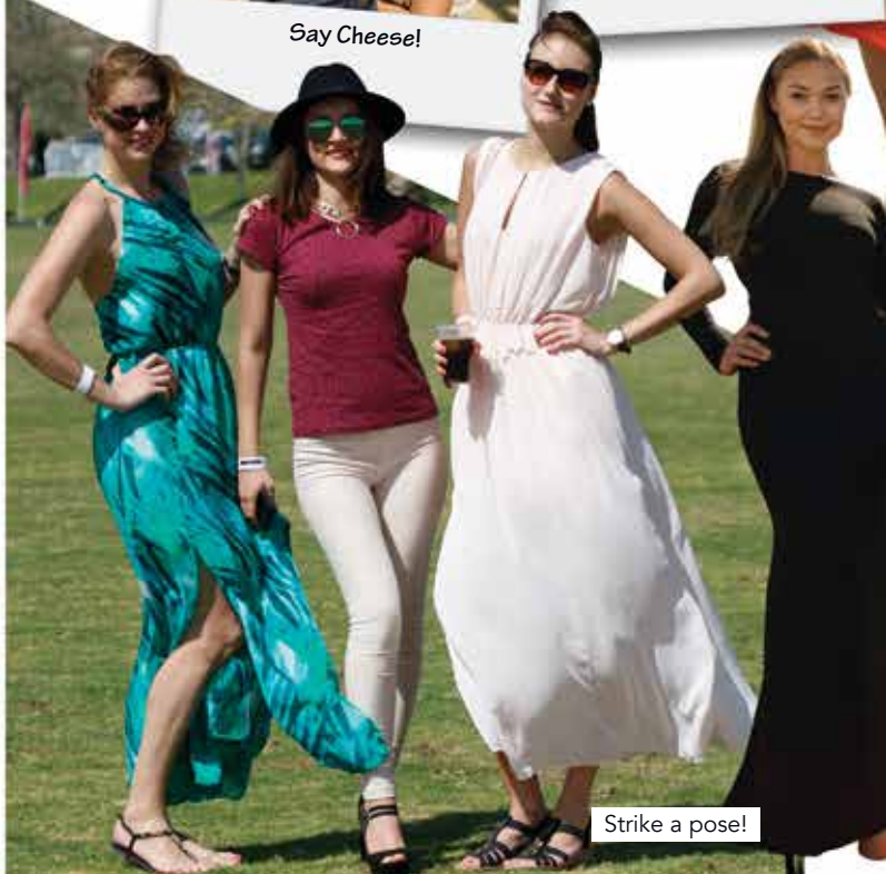
Strike a pose!