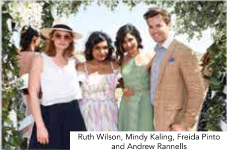
Ruth Wilson, Mindy Kaling, Freida Pinto and Andrew Rannells