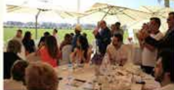
VIP guests at the McLaren Cup