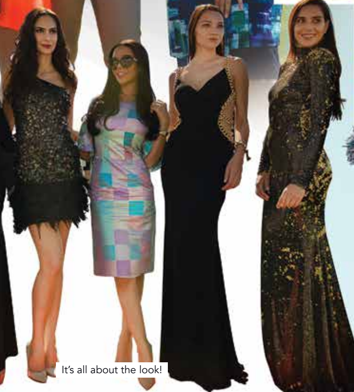
It's all about the look!